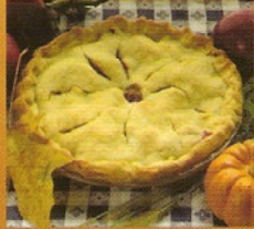
Food & Crafts