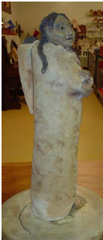
Clay statue: Sakakawea and her son Pompey.

The items above are on display at The Shoppe, so stop in to see them and have a little visit. For a list of additions to the silent auction or if you have questions please e-mail: marlette@bis.midco.net