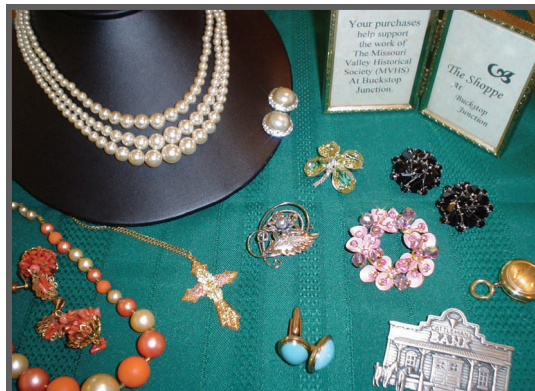
Samples of some of the items for sale at "The Shoppe" at Buckstop Junction.