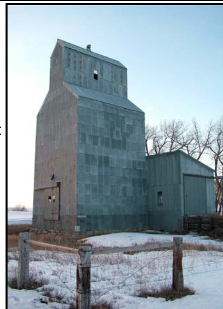
Brittin Elevator

The Brittin elevator pictured at the right was built along the Soo Line Railroad in Burleigh County, northwest of Moffit. The town of Brittin lost the last of its residents during the Great Depression and the post office closed in 1933. The elevator still stands, but for how long?