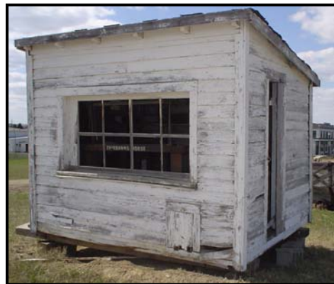
Scale House at Buckstop Junction today .

The Scale House is built of full dimension lumber and it is possible it began as a "Line Shack", a Government building during the Homesteading Era of western North Dakota. When land was available for homesteading, many Line Shacks of this design were used as information centers to help settlers locate available land. These Shacks provided the settlers with a local agent so they didn't have to make the long trip to the county seat.