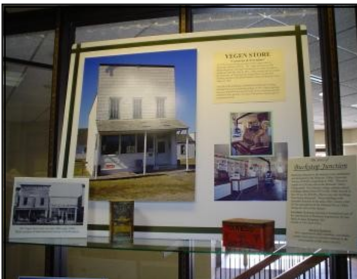
A closer look at the Yegen Store Display.