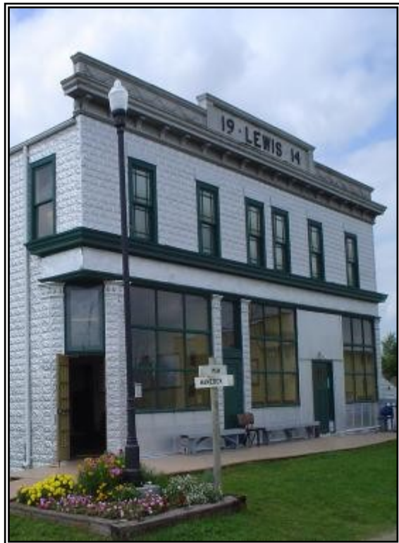
The Lewis Hotel Buckstop Junction: Progress in Preservation!

This organization shall stimulate, coordinate, conduct and assist in activities relating to the preservation of this area's history.