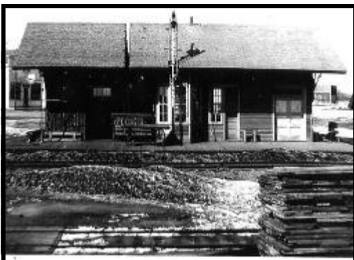
The Sterling Depot during downsizing. Note the cut in the roof!