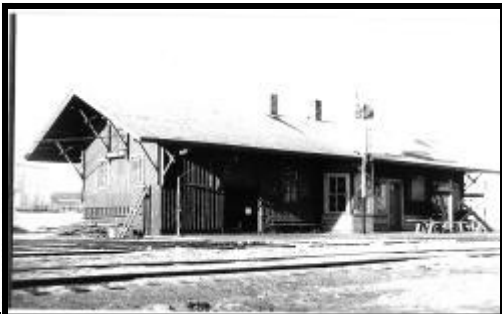
The Sterling Depot in its original layout.

This is the story of a little railroad depot that used to be bigger. This is a chapter in the story of the Sterling Depot that is now located at Buckstop Junction. In about 1885 this depot was built to service the Burlington Northern Railroad at Sterling. This was during the era when this area was known as Dakota Territory.