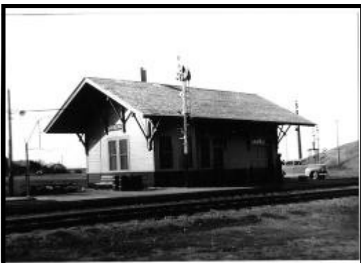
The depot after it was completely restored in Sterling