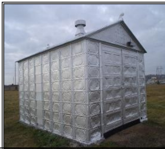
The Rusk Auto House